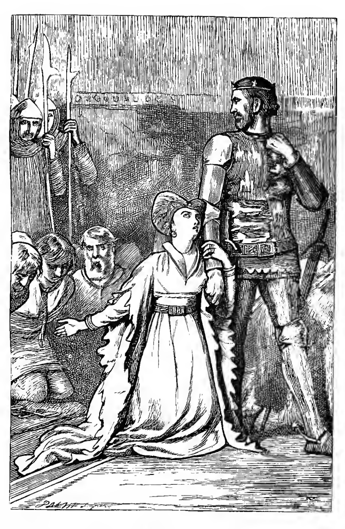
The Intercession of Queen Philippa for the Citizens of Calais.